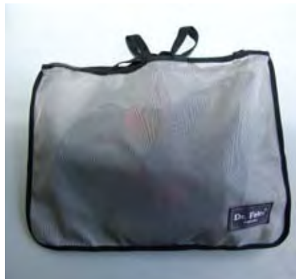
ETL3-80SET ETL 3 Equine, training laryngoscope, Set, complete in case and separate bag for halter, (see page 2+3)