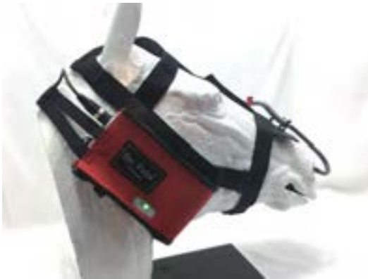
Right side: Recorder with built in Battery (Green control light)

Head Mounted Overground Laryngoscope – Our invention and first publication of an equine training laryngoscope in 2007 was followed by many market requests. Taking our experiences from the first generation, we have developed a completely head mounted and modular system with the latest LED technology. It will allow even very young horses to be examined. Additional weight is just 950g on each side of the cheeks. The rider is not involved at all during the exam. Our recording and video transmission includes automatic audio. Mounting, fixation and dismounting is fast and uncomplicated. Service and replacements can be done immediately due to the modular construction.