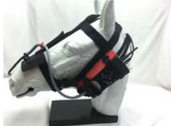
Halter system (ETL2-82HR)